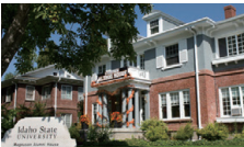
Idaho State University