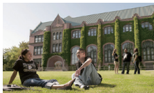
University of Idaho