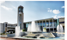
Missouri State University