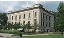
Indiana State University