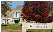
Rhode Island College