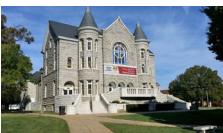
Virginia Union University