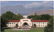
New Mexico State University