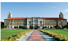
Texas Tech University